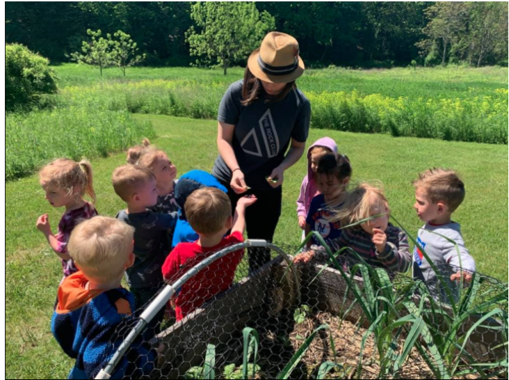
A science lesson outside (eating spinach that we planted)