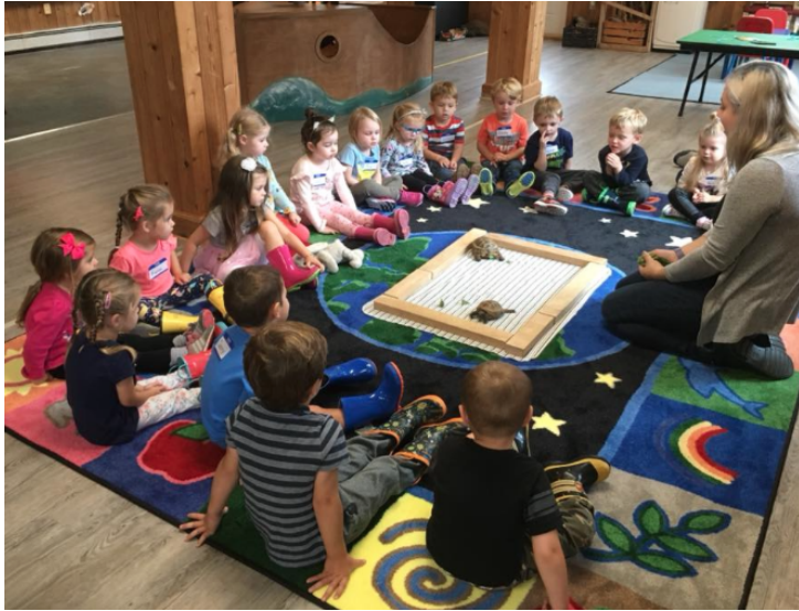
Circle time inside (feeding our classroom tortoises)